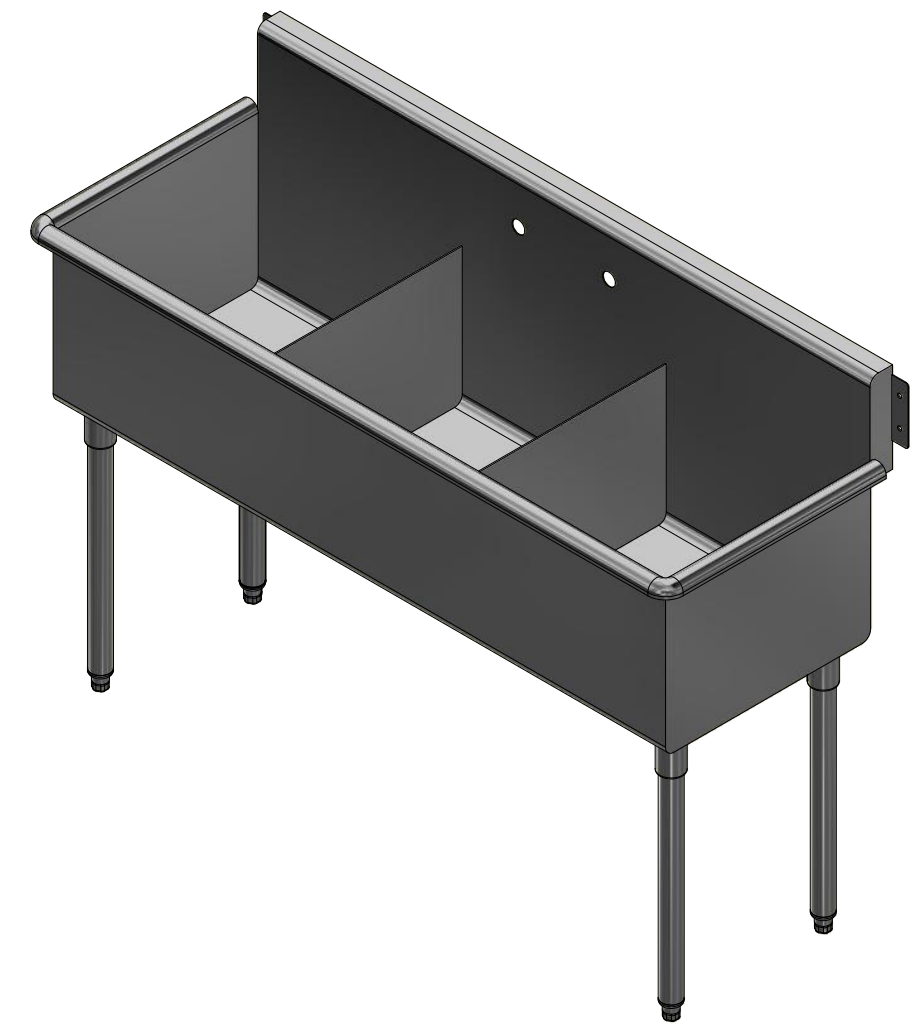
3D SCALE 1/12