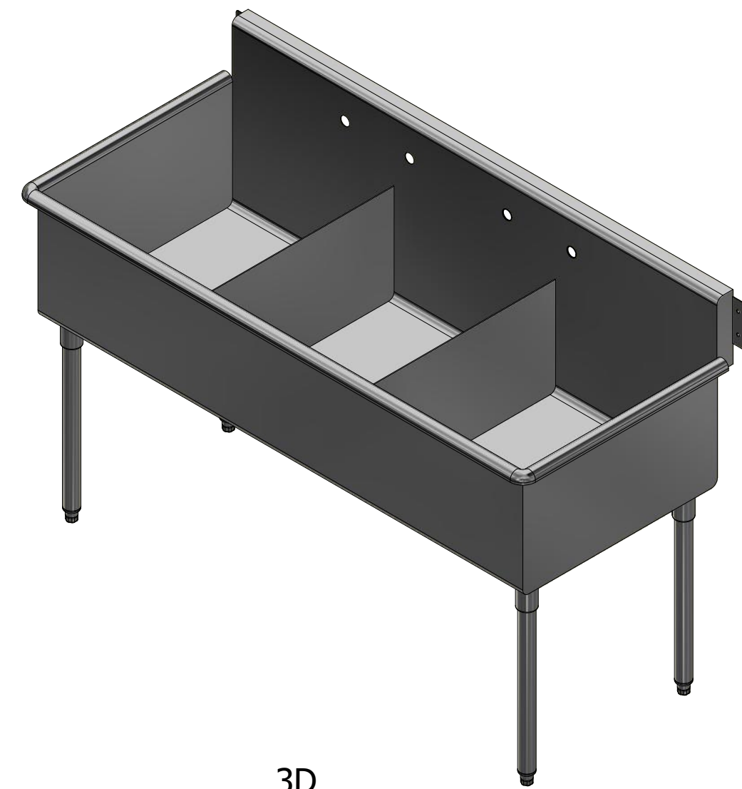
3D SCALE 1/12