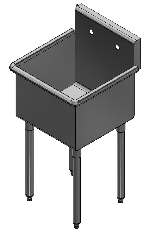
3D SCALE 1/12