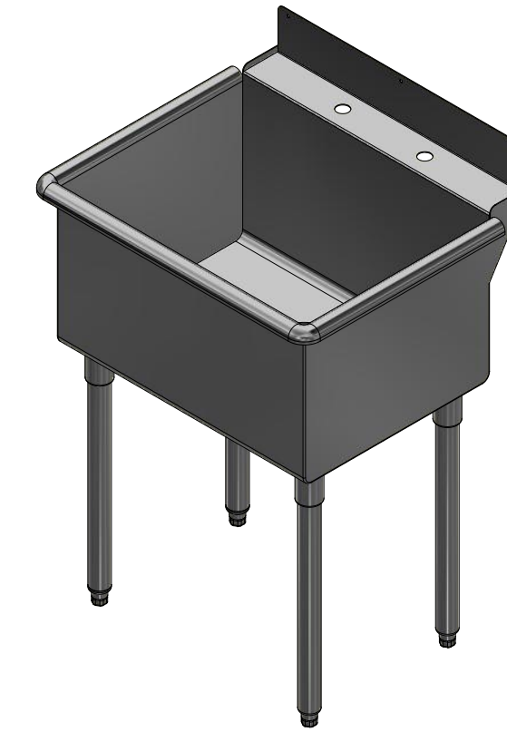
3D SCALE 1/12