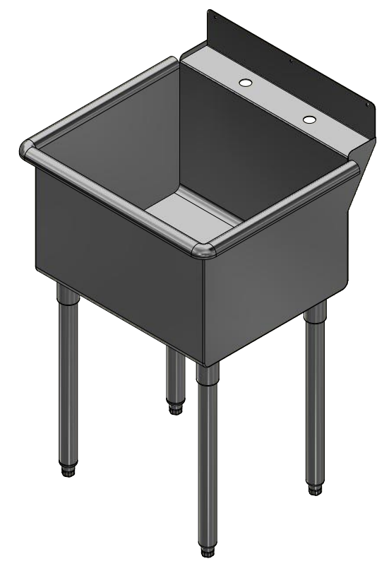
3D SCALE 1/12