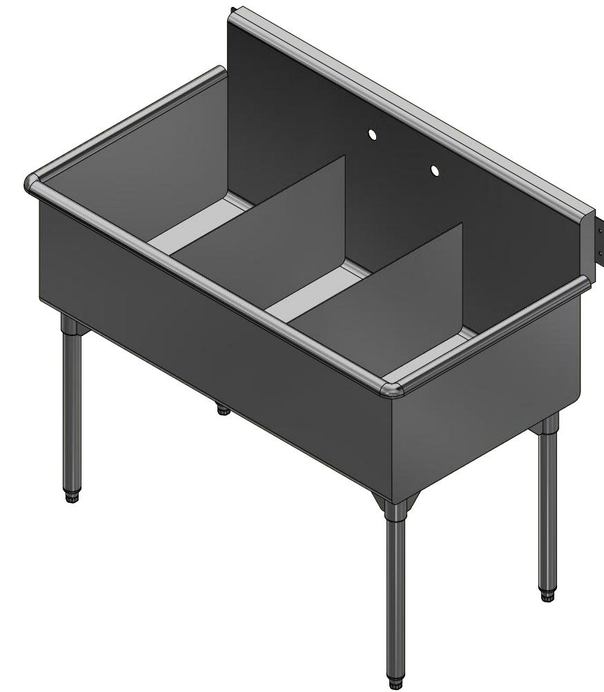
3D SCALE 1/12