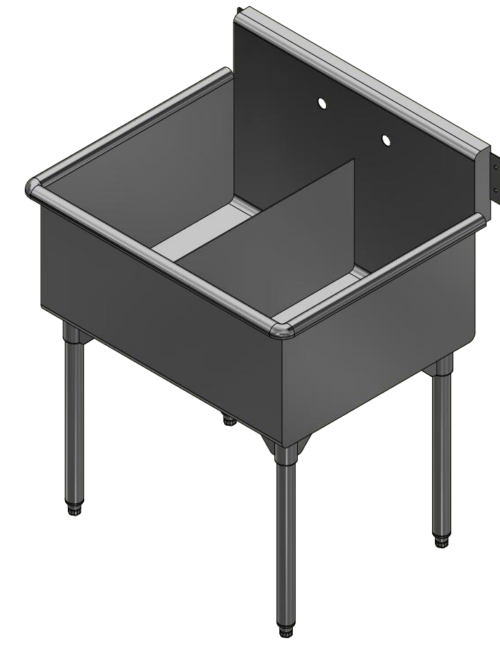
3D SCALE 1/12