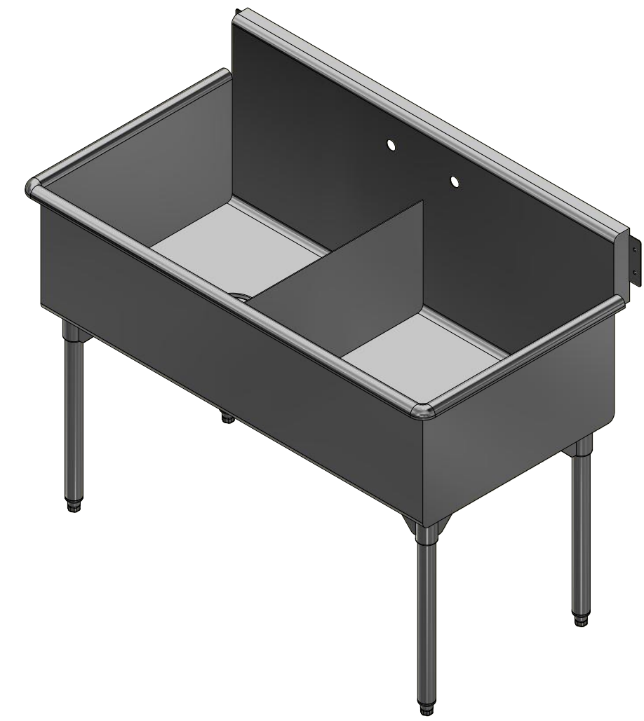
3D SCALE 1/12