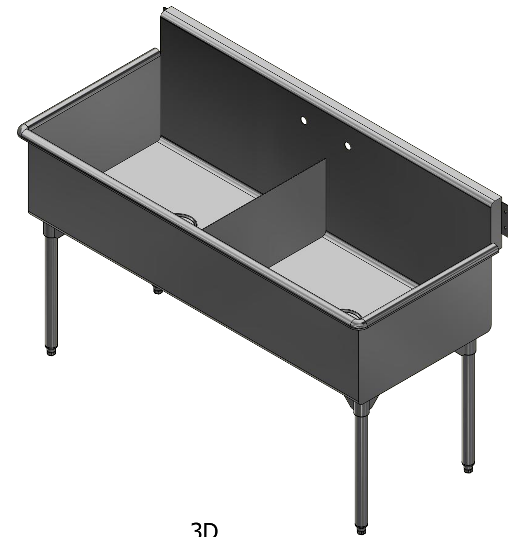
3D SCALE 1/12