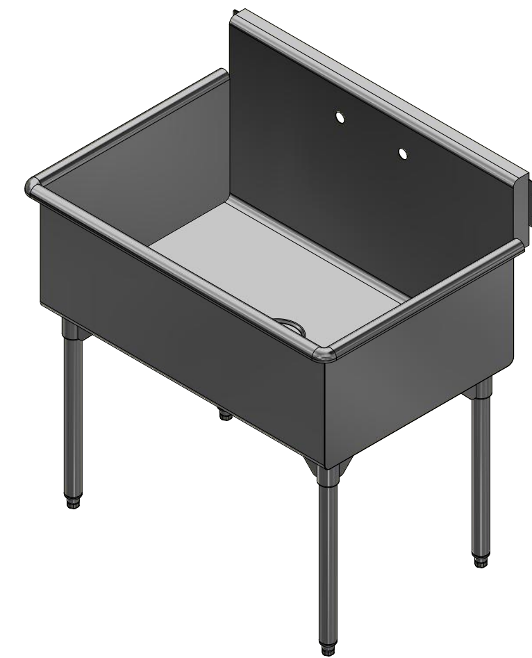
3D SCALE 1/12