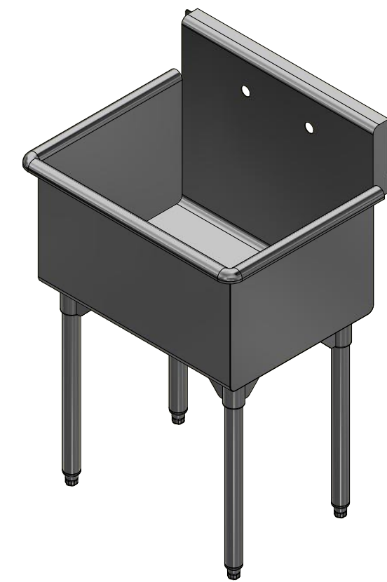
3D SCALE 1/12