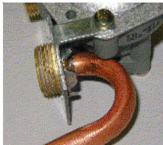
Figure 3 Detail of hot water outlet pipe and bracket (step C4)